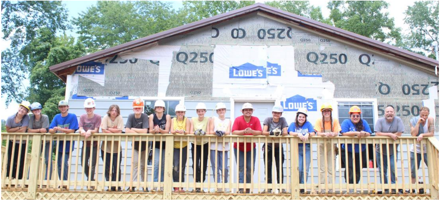
Volunteers from the HumanitarianXP group working on the new CoalField Housing homes that SALS is building in Page on the site of the former African-American School donated by the Fayette County Board of Education